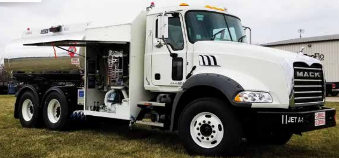
10.000L Jet A1 Refueler